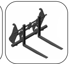
Forks Mounted on Quick Coupler