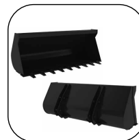
One Piece Bucket