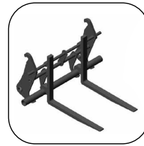
Forks Mounted on Quick Coupler